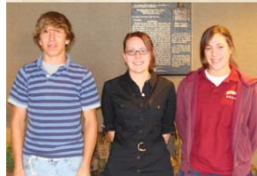
Pictured Left to Right:

Thank you to everyone who participated in our short story contest!